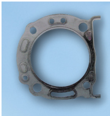
Stopper layer, engine block side

The metal stopper layer and the functional layer show significant black discoloration near the cooling duct. Gas has leaked between the stopper layer and the functional layer.