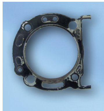
Functional layer, head side